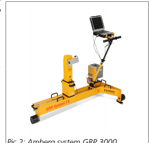
Pic 2: Amberg system GRP 3000

Dimetix Laser Distance Sensors integrated in this device, not only do clearance control measurements but also overhead wire measurements. The sensors are fixed on a mounting bracket. Their laser beam is aligned manually to the respective object. The sensors measure contactless on any type of natural target in a distance range of up to 65m. If required, their temperature range may be extended by an optional heating device from -10°C - +40°C to -40°C - +50°C.